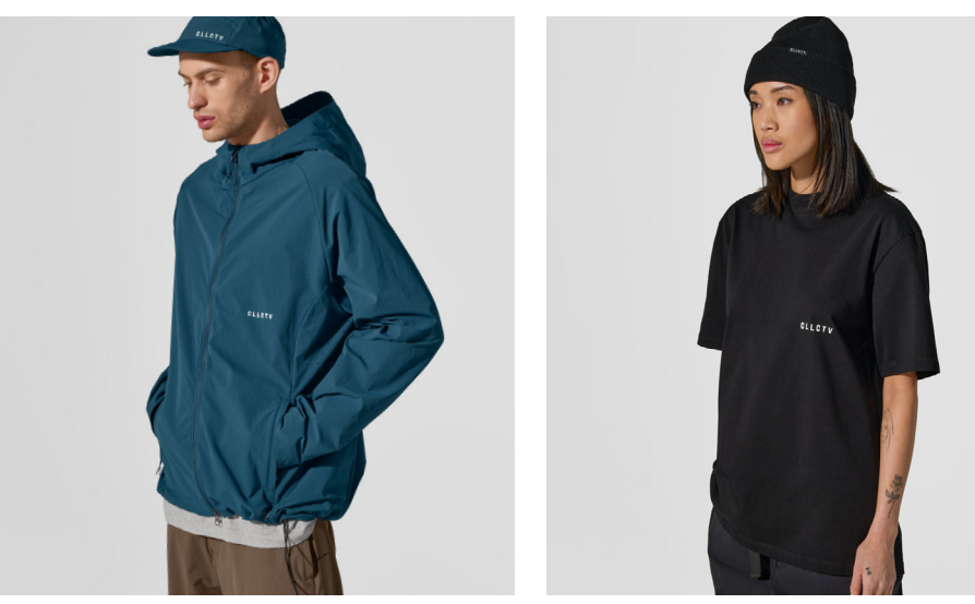
CORE LIGHT JACKET